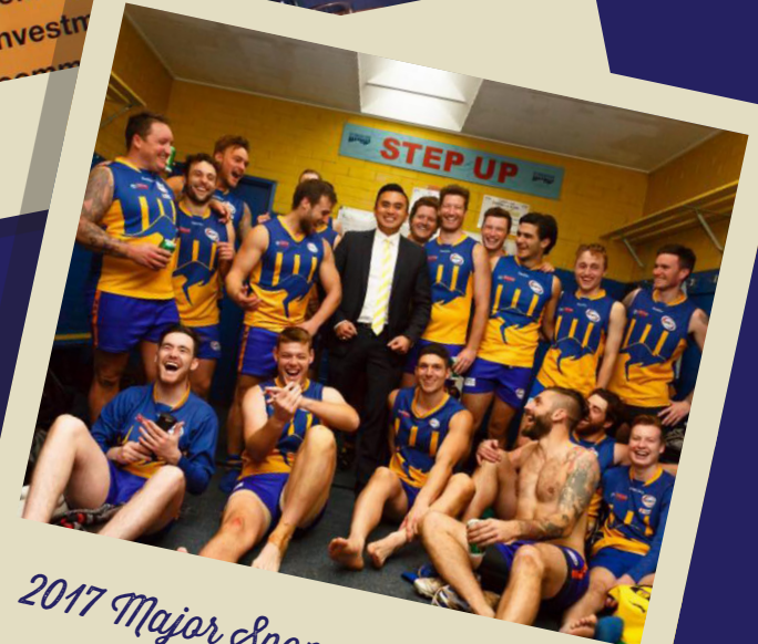
2017 Major Sponsor - Ray White