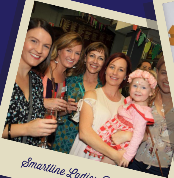
Smartline Ladies Day 2016

Smartline Ladies Day Sunshine Football Club 2016